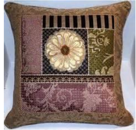
Stitched by Dawn Taubin